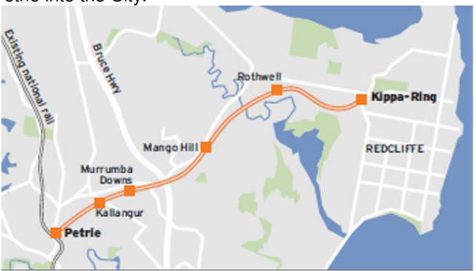
Maps from Courier-Mail 7 and 27 July