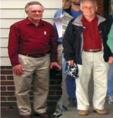
The Treasurer in his "AATTC AGM shirt"